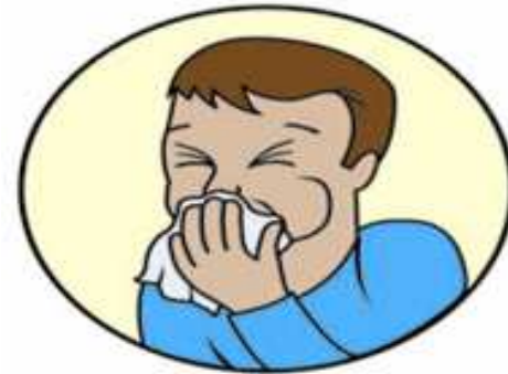
• Cover your cough.