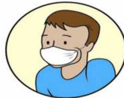
A face mask may be needed if you are coughing.